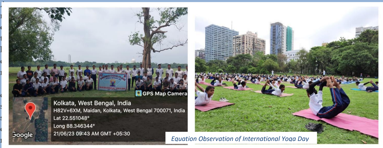
Equation Observation of International Yoqa Day

ial event is the Students' Election for their representatives in the Students' Council. The Elections take place in a very congenial and healthy atmosphere. The College is adorned with extremely