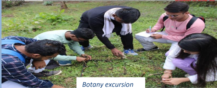
Botany excursion at Karseong

Latitude: 27.044846 Longitude: 88.267679 Elevation: 2148.96±3 m Accuracy: 46.6 m Time: 03-06-2023 09:04 Note: danielip