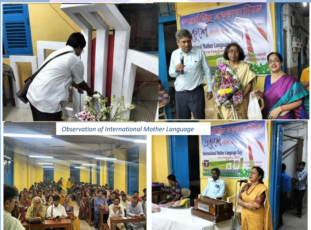
Observation of International Mother Language

Corona has made a hard setback to mankind but if every human being accepts the lesson from the Corona catastrophe that it may act as a silver lining as well by teaching us a better survival strategy. Coronavirus (COVID19) is a special health issue in the year 2020, which is being skillfully managed by the college authority. The classes and other activities except office was suspended from 16 th March 2020, and it was totally closed after the declaration of lockdown by the Prime Minister on 22 th March 2020. However, the college office resumed its official duties from the last week of May. The college building was occasionally sanitized. The Principal, Vice Principal, Bursar, Head Clerk, Cashier and other important staff were present in the college at least 2-3 days per week. The Governing body meeting took place in the college on 7.7.2020.