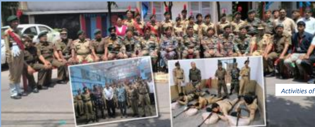
Activities of NCC

a parade was organized in Fort William. Our N.C.C. students got job in many government sectors such as the Indian Army, Indian Police Service, etc. Students participate in state and national level camp every year. Previous year the students participated in National Integration Camp at Varanasi. This year it has observed “Safe Drive Save life”, “National Yoga Day” and “Swachh Bharat Abhiyan”