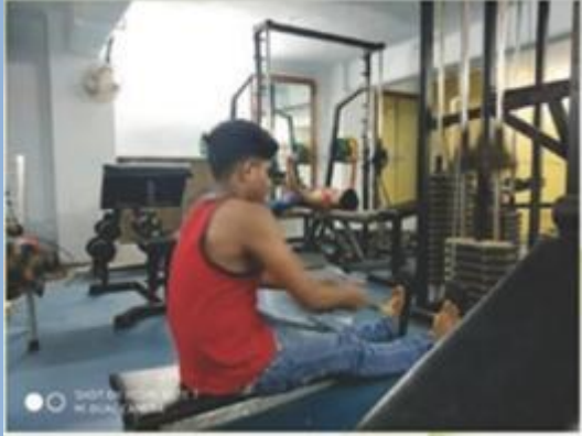
The College Gymnasium