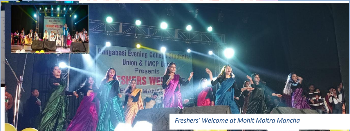
Freshers' Welcome at Mohit Moitra Mancha