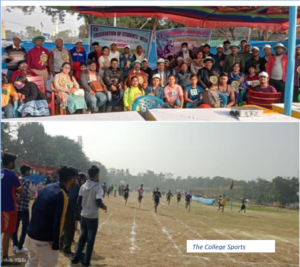
The College Sports