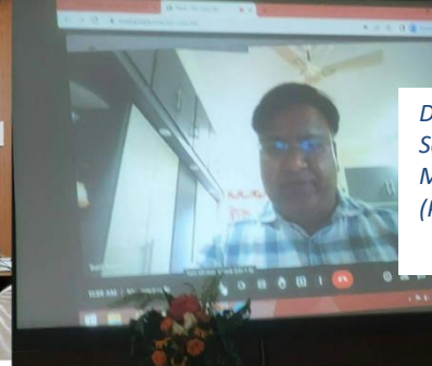
DST Sponsored Seminar of PG Mathematics (Pure) Department