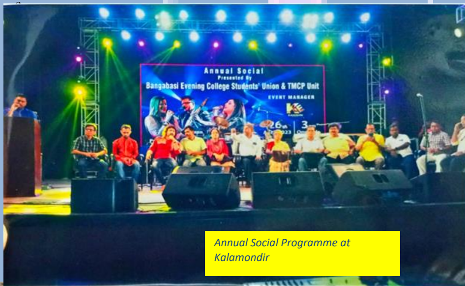
Annual Social Programme at Kalamondir

Formation of habits in civic responsibility, the broadening of outlook and sympathies through varied associations and