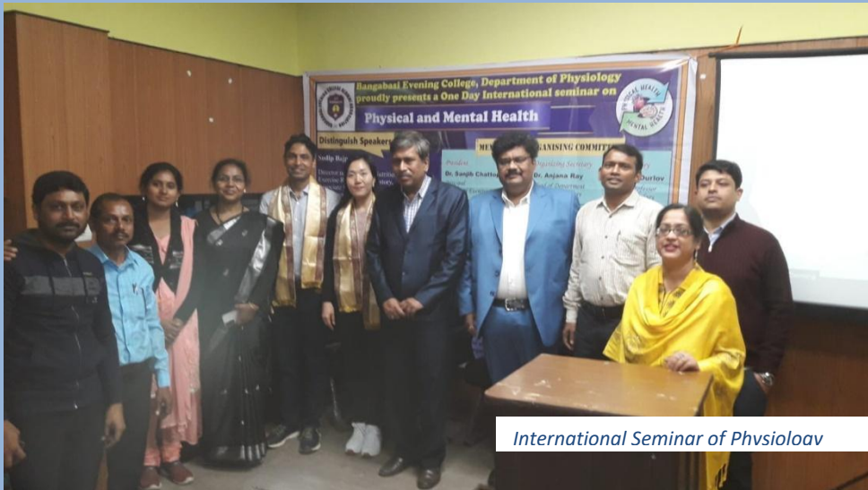
International Seminar of Phvsioloav

The college provides an opportunity to the students for the preparation of competitive examinations. An