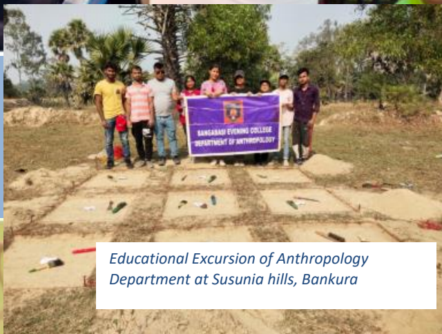
Educational Excursion of Anthropology Department at Susunia hills, Bankura

college has a well-equipped Gymnasium for the students, where most modern fitness of health are kept. An instructor of Gymnasium helps the students in this regard.