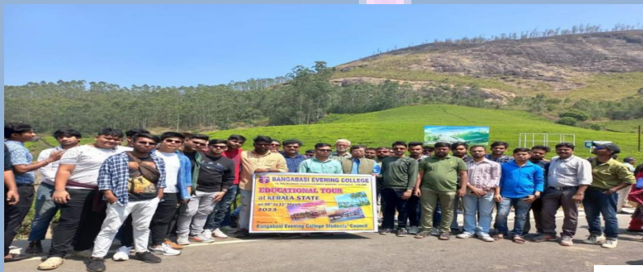
ACADEMIC TOUR AT KERALA ORGANIZED BY STUDENTS COUNCIL