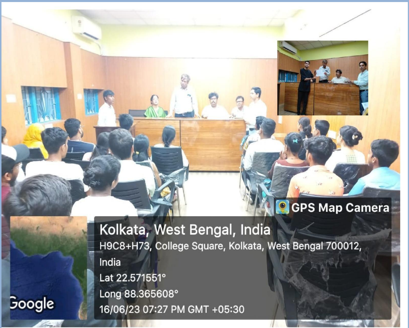
Distribution of certificates from Skill sector (Skill India/National Skill Development Corporation (NSDC) amongst the students of Bangabasi Evening College on 16.6.23.

❖ Modern Instrumentation: The college has a rich stock of modern instruments. This year it has obtained a Grant of about thirty lac from RUSA to purchase instruments. It has purchased several modern instruments including Double beam FT-IR Spectrometer, Spectrophotometer (UV - VIS), BOD Incubator, Microtome, refrigerated Centrifuge, different types of microscope, Digital Polarimeter, Digital Conductometer, Digital pH-meter, Digital balance, Digital Potentiometer and several others.