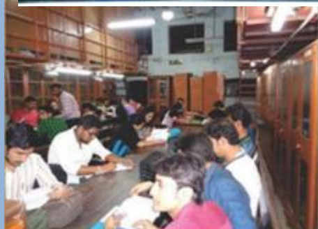
The College Library

participation in the intellectual and aesthetic life of the College and Society at large.