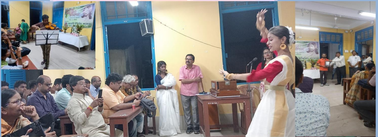
❖ College Auditorium

The College has a spacious auditorium where various functions organized by the students and the staff are held. The A.C. auditorium was originally named Prasanta Kumar Bose Memorial Hall on 22, December 1995. Seminars, Workshops, Cultural Programmes, Educational Symposia, Inter-College Competitions, and Social Debates are arranged here for the enlightenment not only of the students but also the general public. Now major repairing works are continuing from RUSA 2 fund by PWD since last year.