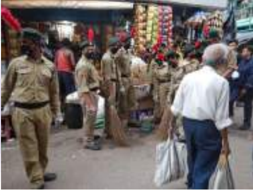
Swachh Bharat Abhiyan by NCC students