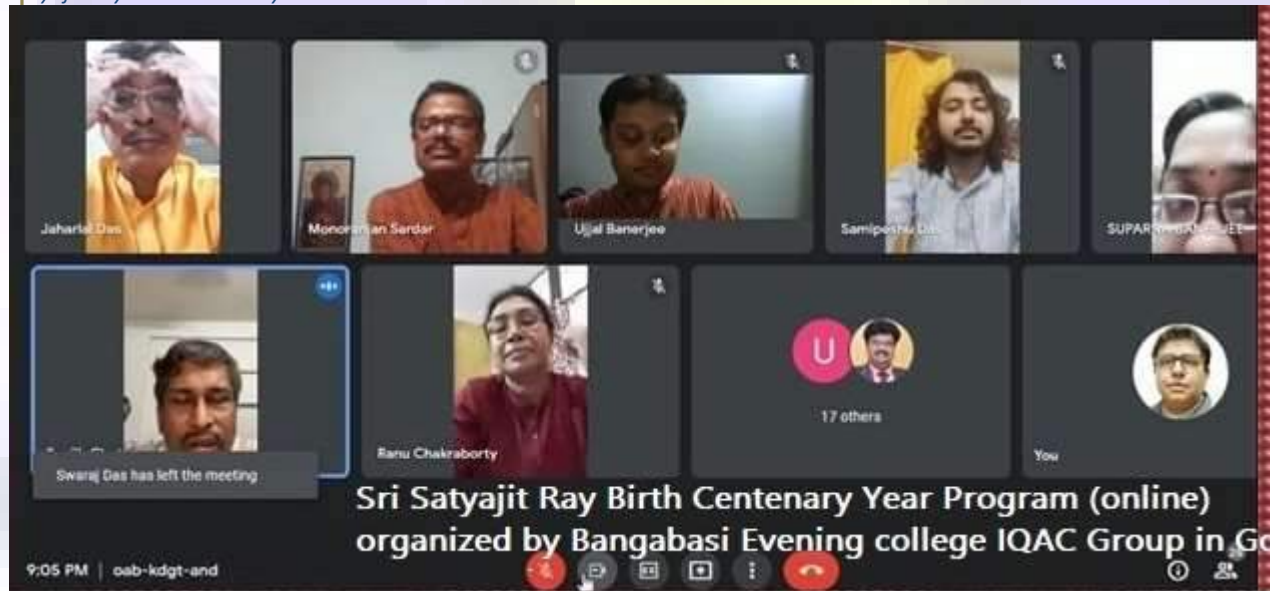
Satyajit Ray Birth Centenary Year Celebration Online