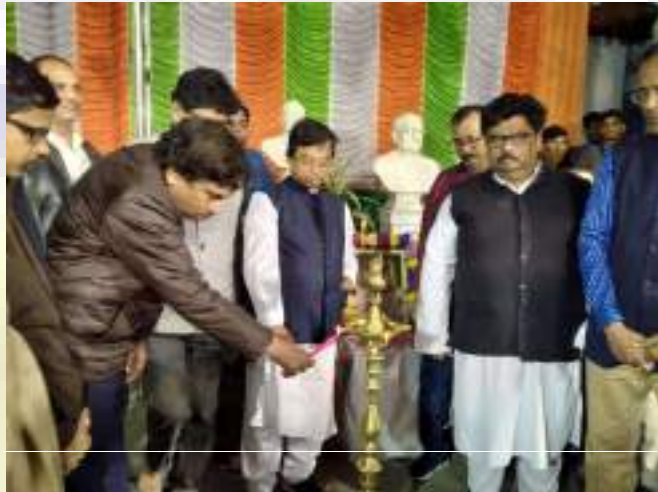
The College Gymnasium

The college has a well-equipped Gymnasium for the students, where most modern of fitness of health are kept. An instructor of Gymnasium helps the students in this regard.