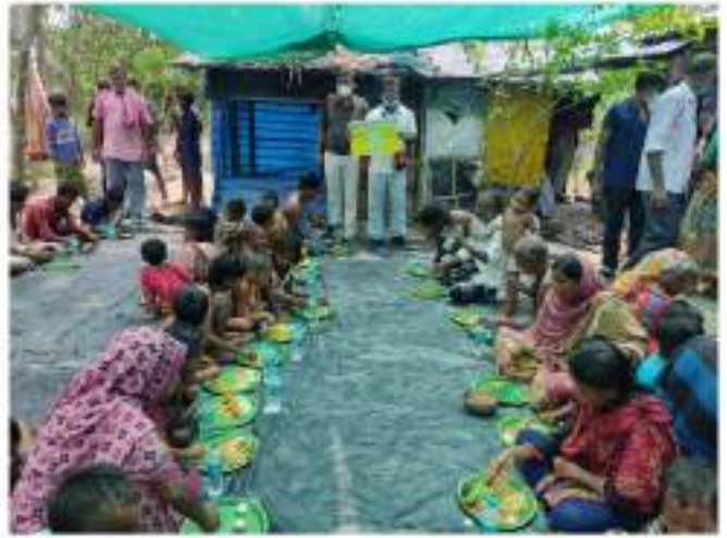
Participation of the college in distributing refuge in Yaash infested areas of Sundarban