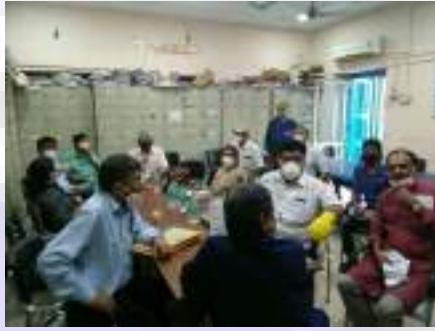
GB Meeting of the College with COVID19 precaution

* Library: The College has a rich source of books available in the college library. INFLIB net, NLIST & Delnet and other modern facilities including E-books are also available in the library. Students should consult the Librarian for pass Ward of these. The books are digitalized and the