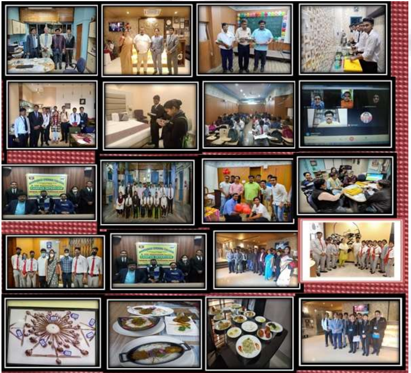
Some relevant pictures of all the activities of B.Voc. in Banking, Financial Services and Insurance and B.Voc. in Hospitality & Tourism, sponsored by UGC and Affiliated to University of Calcutta: