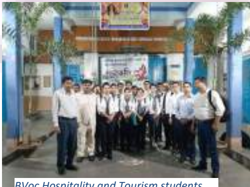
BVoc Hospitality and Tourism students

The College encourages the following types of extra-curricular activities of students as a part of college education: Formation of habits in civic responsibility, the broadening of outlook and sympathies through varied associations and cultural development through participation in the intellectual and aesthetic life of the College and Society at large.