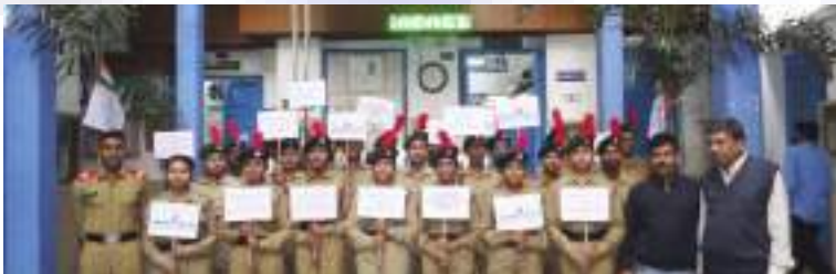
<-NCC Assembly in the college Gate for observing Safe Drive Save life program of West Bengal Government

Now it has become the Neo-Normal trend of this changing world. In the next year attendance of students may also will be counted and evaluation of answer-scripts will be made through college portals, if necessary.