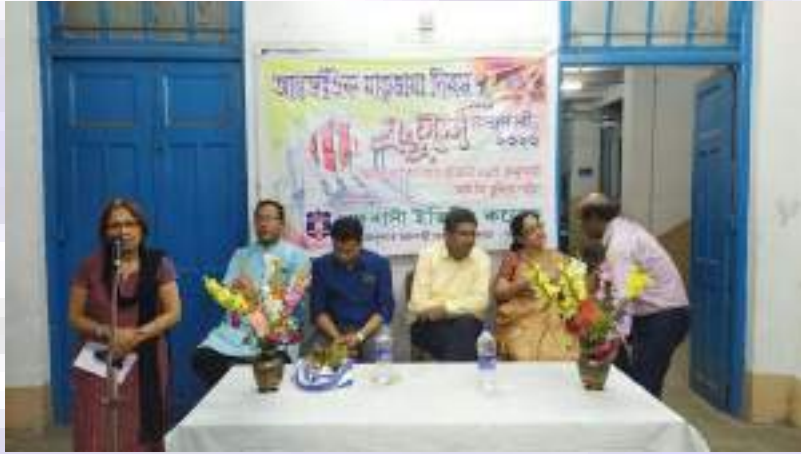
Observation of "Matribhasa Divas"(Day of Vernacular Language)