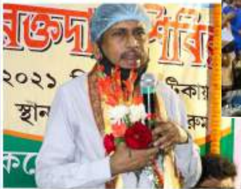
Blood donation Camp organized by the college on 3.2.21