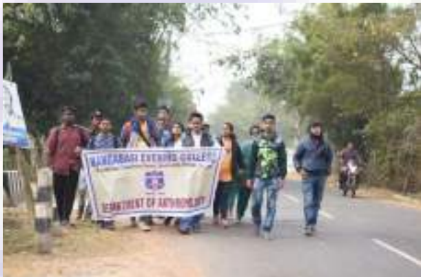
Educational Excursion of PG Anthropology Department