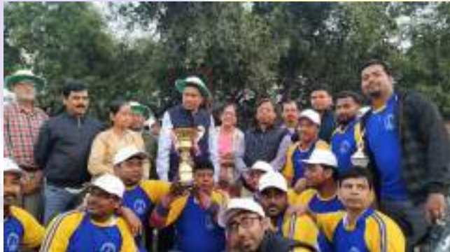
<- Cricket Tournament of the Staff of Bangabasi Group of Colleges in the college playground