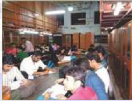
The College Library

library provides digital identity card for each student. Question bank and other modern facilities are available in the library website. Some departments have seminar library of their own.