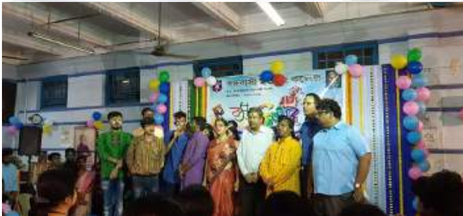
Celebration of "Basontotsob", the festival of colours