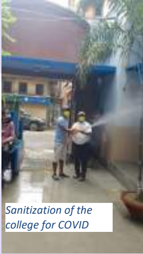
Sanitization of the college for COVID

The College has a spacious auditorium where various functions organized by the students and the staff are held. The A.C. auditorium was originally named Prasanta Kumar Bose Memorial Hall on 22, December 1995. Seminars, Workshops, Cultural Programmes, Educational Symposia, Inter-College Competitions, and Social Debates are arranged here for the enlightenment not only of the students but also the general public. Now major repairing works are continuing from RUSA fund by PWD since the last year.