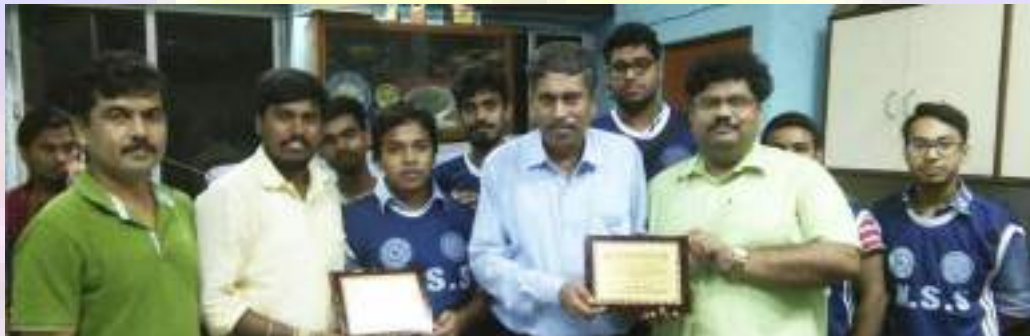
Achievement of the Best Program Officer award and Best Student Participant Award of NSS unit under University of Calcutta