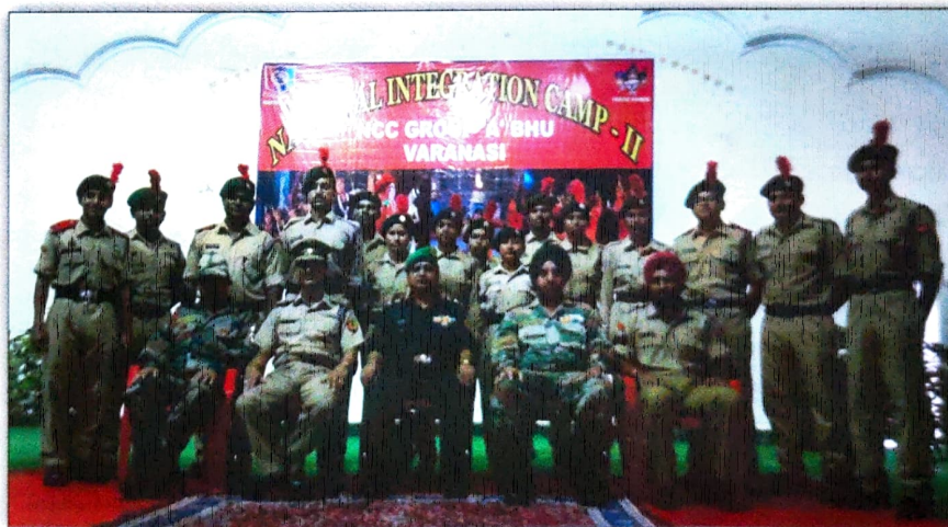
National integration Camp of College NCC Students at Varasasi