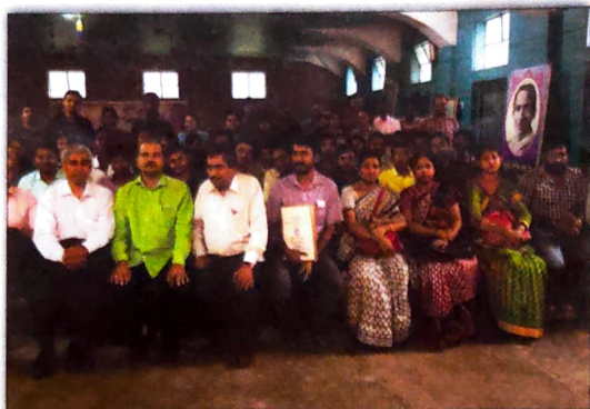
UGC seminar of PG Mathematics