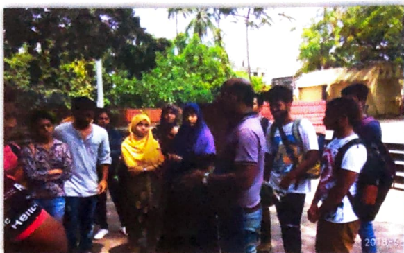
Excursion of Botany Department

All the financial requirements of the students' union are met by the college. College fund the Annual activities of the Students' Union and budgetary allocations are made for that at the beginning of each financial year.