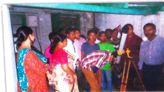
Sky Watch Club

❖ Alumni Association : The association helps to bridge the gap between the glorious past and the present. It facilitates to strengthen the bonds of fellow-feeling with the students of yester-years. This