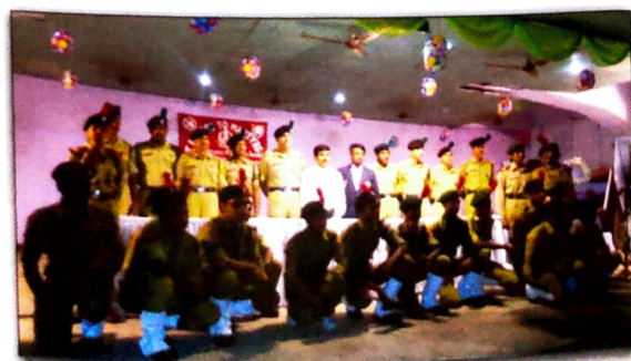
NCC Unit of the College

It is only the NSS activities which can lead young students to become more meaningful and fruitful to the society which is in extended sense, encompasses the entire humanity. More than hundreds of volunteers as well as the dedicated teachers form the college are always active and sincerely busy