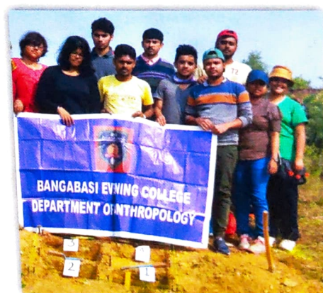
Anthropology Field Work

❖ Educational Tour : Education tour organized in each year on regular basis and a sizable number of students participate in this tour under the guidance of teachers. The tours have already been conducted in South India, Central India