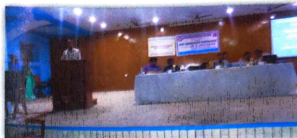
AIDS awareness Program