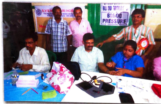
Free Health Check Up Camp

in inculcating the basic principles and programmes of NSS like Environment Enrichment and Conservation, Social Service, Health Check-up and Awareness Programmes, Spread of Child and Adult Education, Women's Development and Gender Justice, Relief and Rehabilitation, Family Welfare and Nutrition, Socio-Economic Surveys, Observance of Various International and National Days/Weeks like National Youth Day, World Health Day, NSS