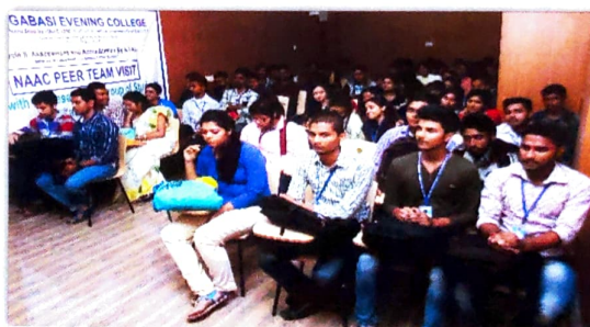
Students in the Smart Class Room before NAAC Peer Team Visit

An online portal has been integrated with the college website for the students who aspire to score high marks in general competitive exams like SSC, LIC, Bank Exams, Rail, School Service Commission, TET, PSC etc. This site will be his/her practice ground. The system evaluates the students based on his/her score. Questions are collected from various competitive exams and presented as online tests here for the students' training. The students may access that portal from the college website or directly through www.e-exammantra.com/BEC .