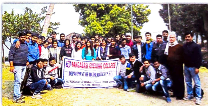
Educational Tour Mathematics