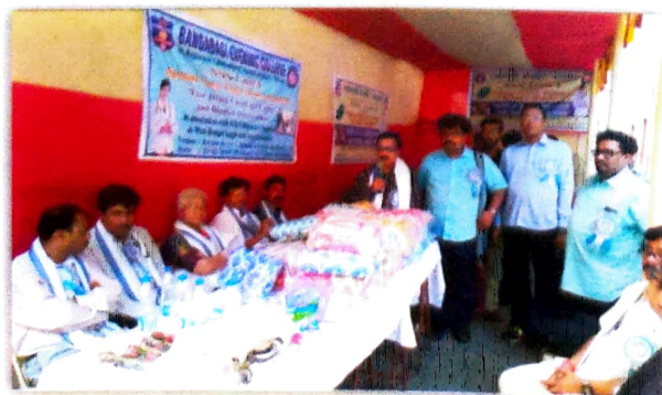
NSS Health Camp 2018