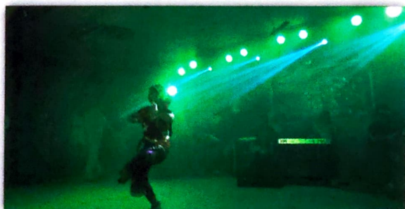
Cultural competition of the students

The college provides an opportunity to the students for the preparation of competitive examinations.