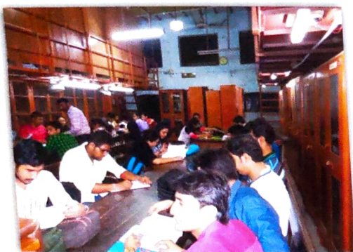
The College Library