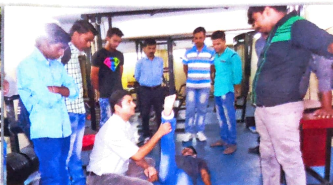
Yoga Training of students at Gymnasium