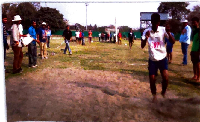
Annual Sports of the students Long Jump